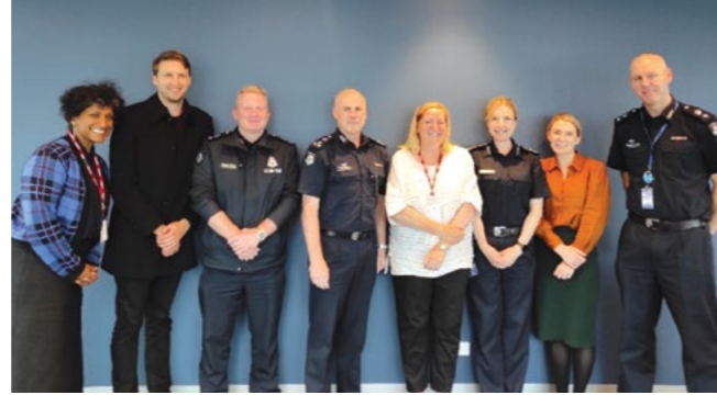
The YCPEIP Steering Committee

2. Advocate for a fairer and more equitable system which includes better access to services.