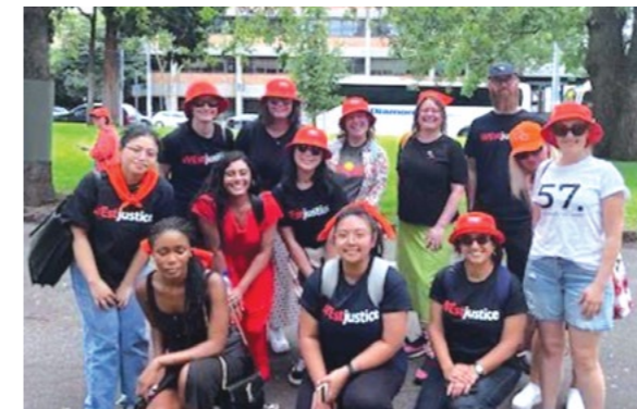
The Westjustice team at the Walk Against Family Violence 2023