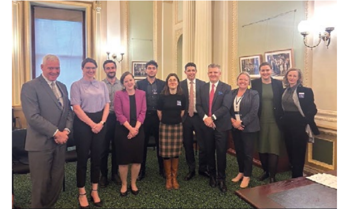
The Westjustice team with Labor for Housing