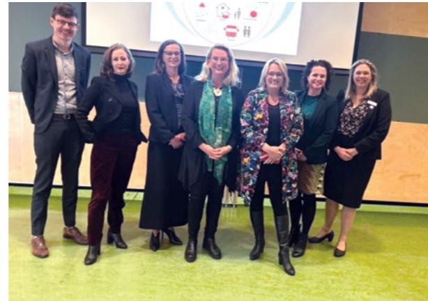
The Westjustice team with the Hon Ros Spence MP and Sarah Connolly MP