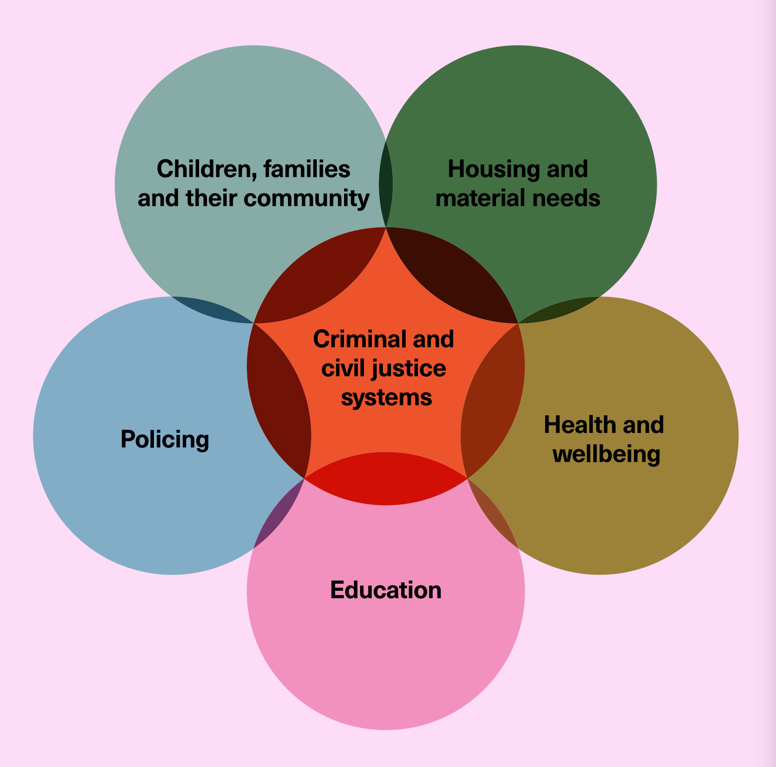
Figure 1: Whole of government and six portfolio areas of focus in SJ4YP's Action Plan.

The over-representation of these five groups of young people in the criminal justice system is an urgent problem that requires our immediate attention.