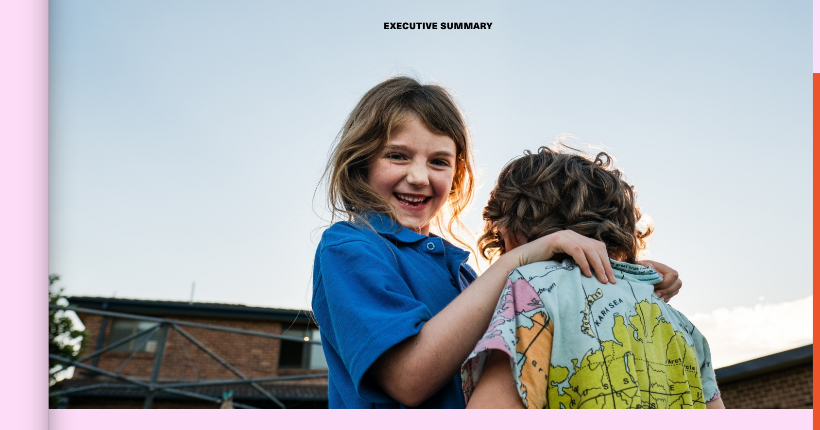
The core of the problem

This Action Plan focuses on the common overlapping systemic and structural factors that cause the over-representation of these young people in the criminal justice system. We often talk about preventing 'youth crime' as if young people are the sole problem.