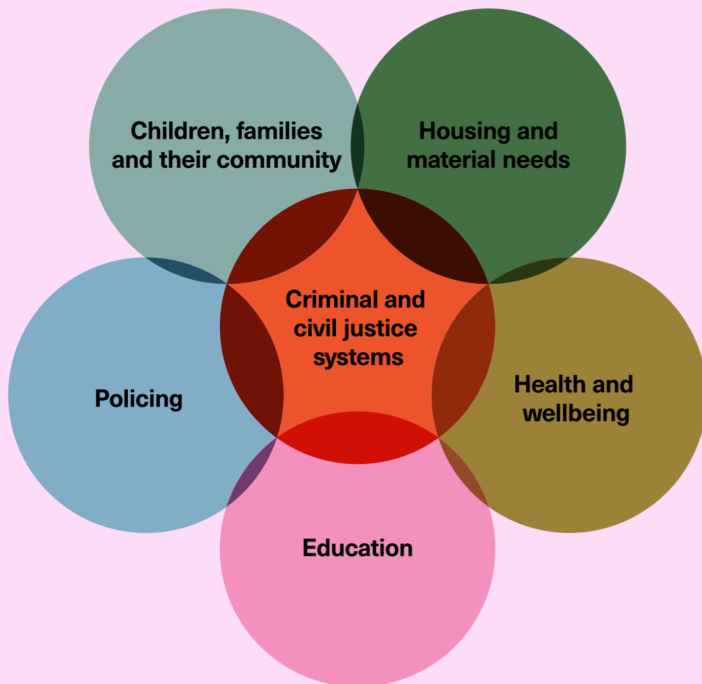
Figure 1: Whole of government and six portfolio areas of focus in SJ4YP's Action Plan.

The over-representation of these five groups of young people in the criminal justice system is an urgent problem that requires our immediate attention . Our Action Plan is the most effective way to enable deep cross-sectoral collaboration; tackle shared systemic drivers; and redirect our efforts and finite resources to prevention and addressing under-representation.