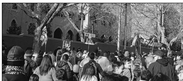
WEstjustice staff attend NAIDOC week rally, July 2019.